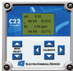
Model C22 Analyzer